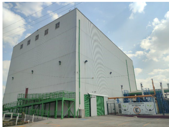
Figure 5 - Outside view of PCH-CDMX.

As operation ramped up during the past two years, several operational challenges have been identified with many of them successfully addressed, increasing operational safety, process throughput from less than 1 tonne per hour to 2.3 tonnes per hour, and extending the continuous operation from one week to over three weeks. Other operational challenges, of which complexity and cost are higher, have been designed and will be implemented during the Phase II expansion. In parallel, substantial expertise in a previously unavailable technology in Latin America has been acquired, both in engineering and operation. Amongst the solutions yet to be implemented, a highly robust and automatized biomass conditioning system able to receive raw MSW and output clean, pumpable material will be deployed as part of Phase II, further increasing system throughput and lifespan.