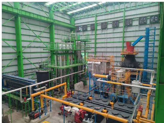
Figure 4 - Inside view of PCH-CDMX.