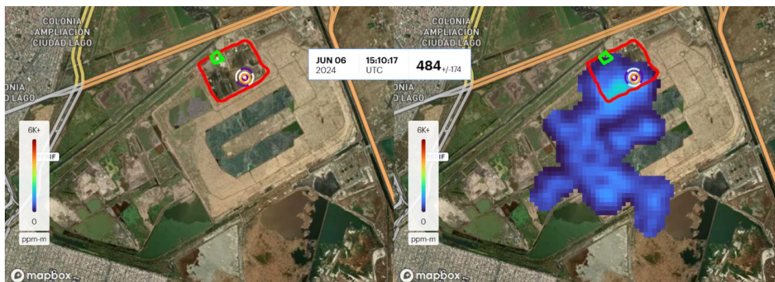
Figure 1 - PC-BP site and overlay of methane plume (blue). Origin of plume is the orange point encircled in purple, PC-BP outlined in red, PCH-CDMX outlined in green.

The Integrated Waste Management Program for Mexico City 2021-2025 (Programa de Gestión Integral de Residuos para la Ciudad de México 2021-2025) contemplates the continued operation and future expansion of the Mexico City Hydrothermal Carbonization Plant (PCH-CDMX) as one of its key actions (AGIR-CDMX, 2024; SEDEMA-CDMX, 2021b).