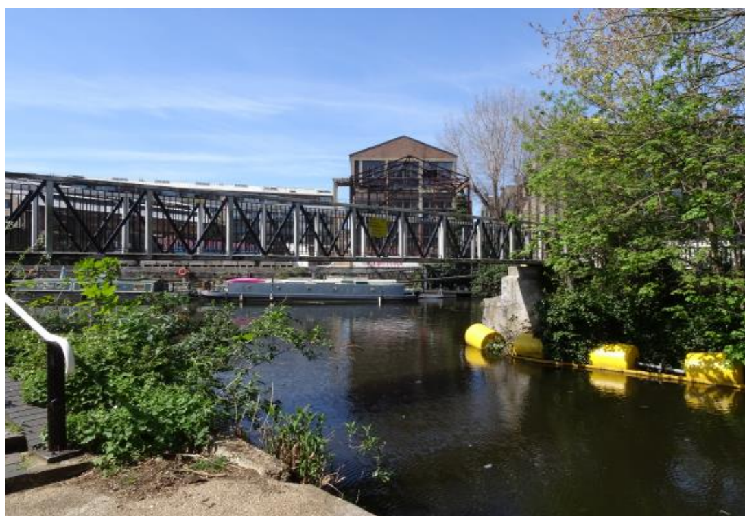
Figure 3: Old Ford Locks, view from the QEOP

In London, the transformation of a part of the Lower Lea Valley into green space was an integral part of building an Olympic legacy (Evans, 2016). Once the industrial land has been freed from its initial function, the prospect of creating the park opened up - the QEOP, which hosted the Olympic stadium and swimming pool, the BMX tracks and the VeloPark, connected by leisure areas, lawns, playgrounds, and access to the banks of the River Lea. To the east, near Stratford, the Athletes' Village was partly converted into housing, pending new residential developments. Opened to the public in 2013, the QEOP was relayed as one of the major successes of the facilities linked to the OG16. The industrial buildings were more fragmented and surrounded the park which hosted the main sports facilities. The roads and canals framed the space, but it was the park itself that connected all these elements into a whole, as a central figure of transformation of the landscape designed and developed for the OG (Figure 3).