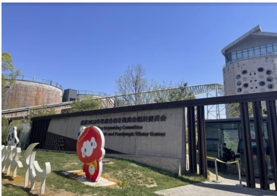
Figure 5: BOCOG offices and Olympic mascots, Beijing

For Turin, the desire to develop as a tourist destination was really one of the major objectives that followed the post-Olympic redevelopment. The launch of the Made in Torino Tour in 2005 was an attempt to prepare the tourist revival of the city by also including its industrial past. This was a dual initiative of the local tourism agency created for the OG, Turismo Torino and the Chamber of Commerce (Otgaar, 2010). This direct cooperation between tourism actors and industrial actors was built as an expression of local expertise, and the city of Turin juggled between the need to renew its image, and that of not neglecting its culture and its industrial past (Otgaar, 2010). Today, industrial tourism is mainly developed around the Lingotto and the Eataly gourmet store, opened in 2007 in the former Carpano factory (Colombino, Vanolo, 2017), which combines local food trade, restaurant, and museum. This Olympic, industrial and gastronomic tourism aims to illustrate the multiple facets of Turin's post-industrial identity, in the construction of an eclectic metropolitan destination.