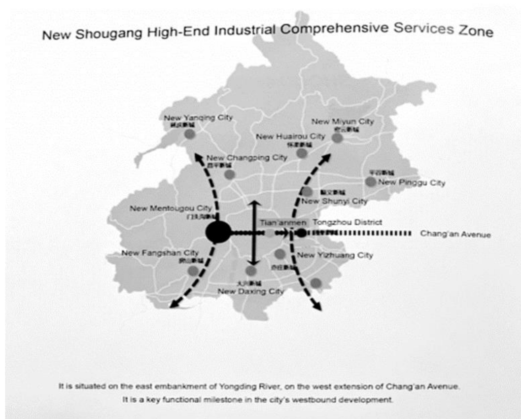
Figure 1: Location of Shougang in the Beijing metropolitan area